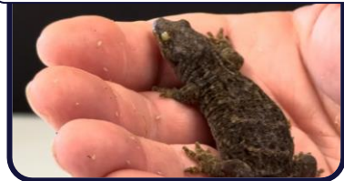
New Zealand gecko