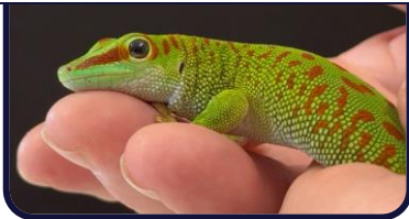
Madagascar day gecko