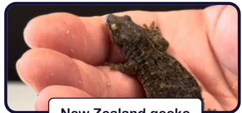
New Zealand gecko