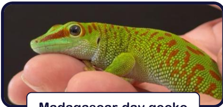
Madagascar day gecko